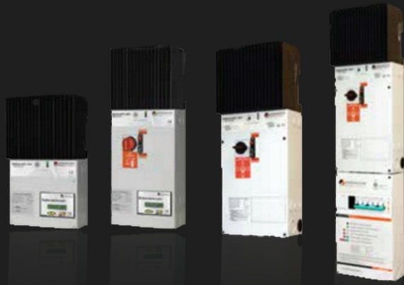
Standard, DB, TR, and TR with GFDP versions shown with optional display meters