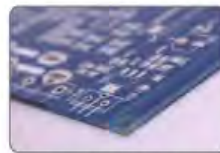
Optimized circuit design