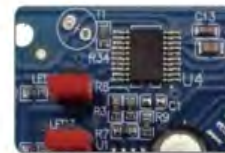
SCM accurate control