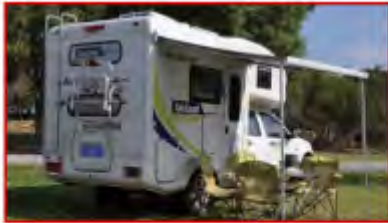
RV, boat & field power supply solar system