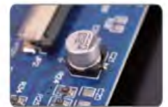
Selection of quality materials