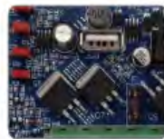
Stability, high efficiency, high integration