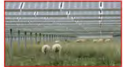
Farm solar generation system