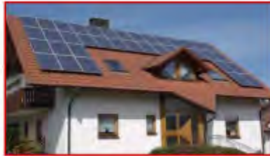
Off-grid home solar system