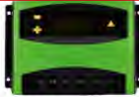
Model: RSC1224-40P, 50P

Packing info: 30pcs / carton Carton size: 535mm x 425mm x 200mm Gross weight: 12Kg Volume: 0.045m 3