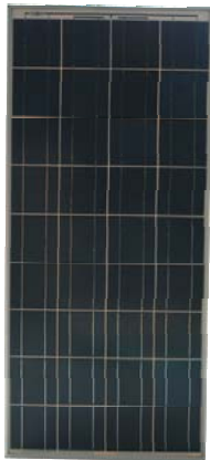
High Efficiency PV Modules