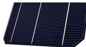
Frame thickness: 42 mm