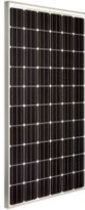
SITECNO MODULE Monocrystalline