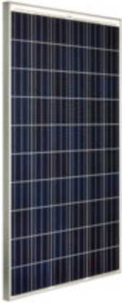
SITECNO MODULE Polycrystalline

Due to the unique combination of components, the high-efficiency modules from SITECNO are particularly powerful. With the high efficiency, the SITECNO offers maximum performance compared to the small overall area required. This also means: less effort and less material for installation. This increase in efficiency and the long-term high energy yields of SITECNO ensure efficient operation of your photovoltaic system. The quality of SITECNO module is continuously tested and confirmed by independent institutes. SITECNO modules are stored with a positive power classification. The performance is guaranteed by SITECNO for 25 years, the product guarantee is 10 years.