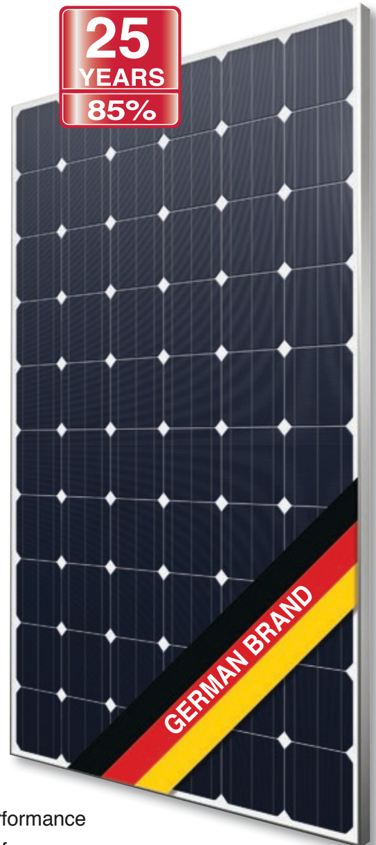
Fig. similar 60M156EN161109A

Exclusive linear AXITEC high performance guarantee!