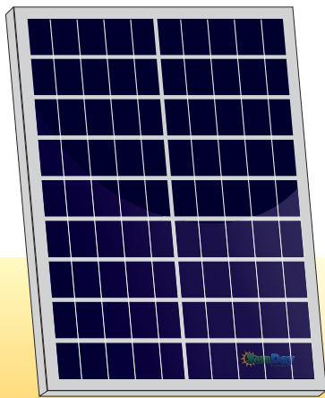
SOLAR MODULE: SDP-5