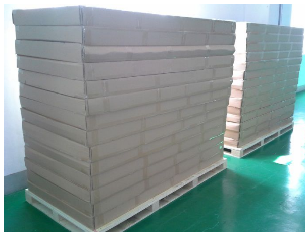
2 pieces/carton, Package size: 1820×1005×115mmmm Package weight: 48KG