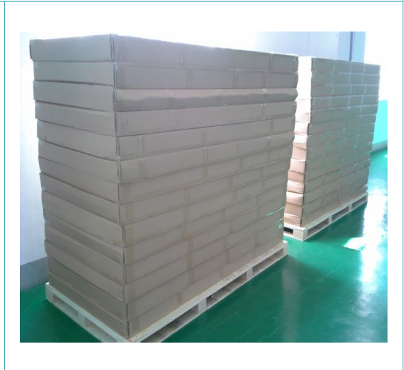
2 pieces/carton, Package size: 1490×600×70mm Package weight: 18.6KG