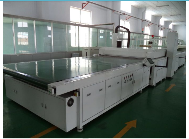
Full-automatic laminating machine