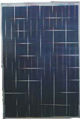
High Efficiency PV Modules