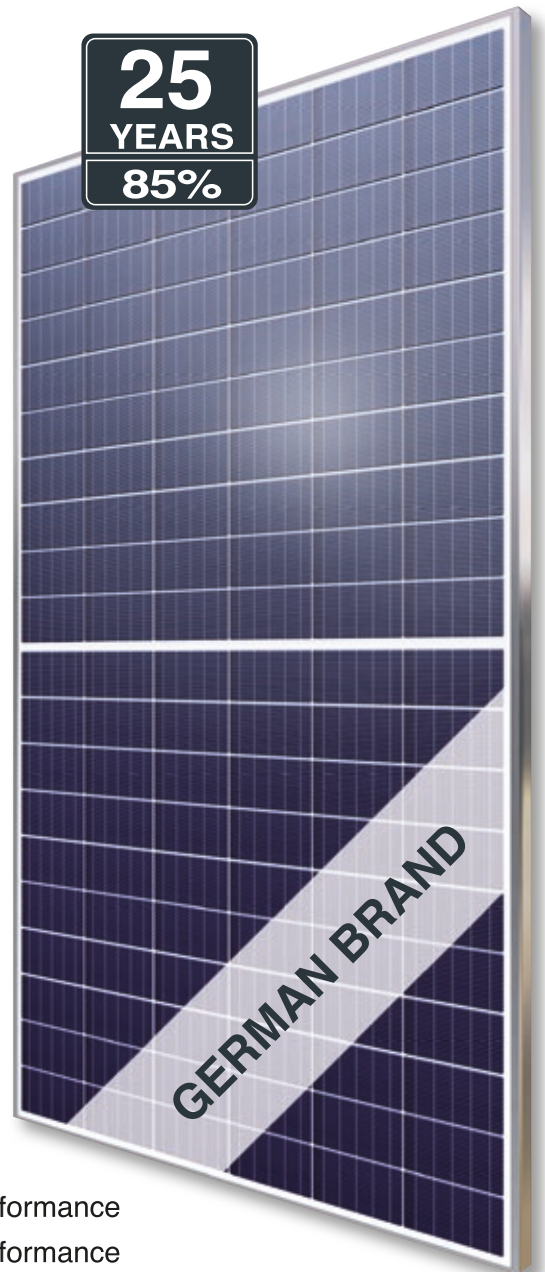
Fig. similar 120MHEN201117A

Exclusive linear AXITEC high performance guarantee!