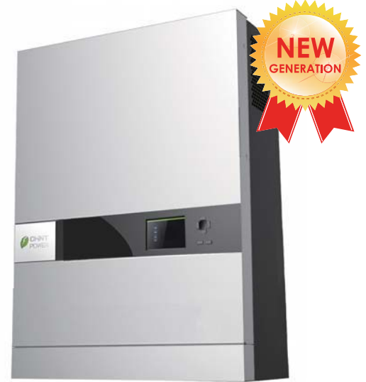
CPS SCA8KTL-DO CPS SCA10KTL-DO CPS SCA12KTL-DO