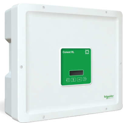
Available in 3, 4 and 5 kW