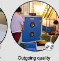
Outgoing quality assurance(OQA)A