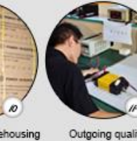
Packing and warehousing