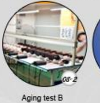
Aging test B