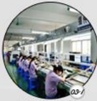
Production-line of plug-in board A