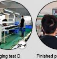
Aging test D