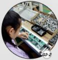
Production-line of plug-in board B