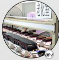
Aging test A