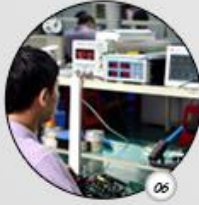
Semi-finished product inspection