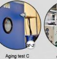
Aging test C