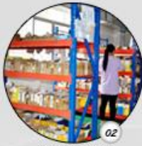
Warehousing checking and distribution