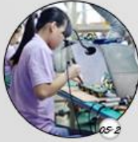
Welding repair B