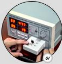
Incoming Material Inspection