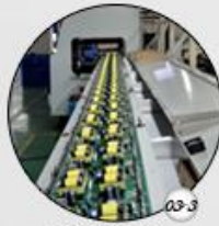
Production-line of plug-in board C