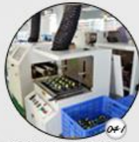
Automatic spray tin, wave soldering and twice spray tin A