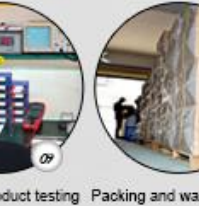
Finished product testing