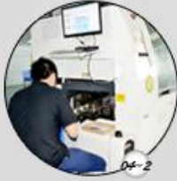
Automatic spray tin, wave soldering and twice spray tin B