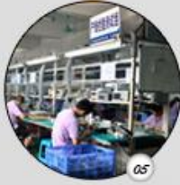
Welding repair A