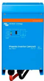
Phoenix Inverter Compact 24/1600

The possibilities of paralleled high power inverters are truly amazing. For ideas, examples and battery capacity calculations please refer to our book 'Energy Unlimited' (available free of charge from Victron Energy and downloadable from www.victronenergy.com ).