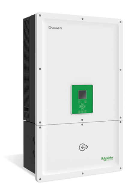
Products shown: Schneider Electric Conext CL 20/25with wiring box