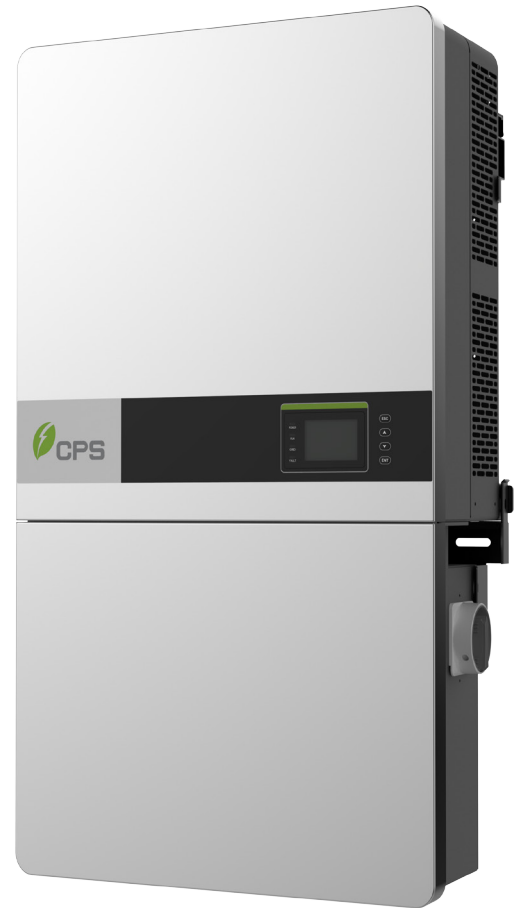
CPS SCA50KTL-DO/US-480 CPS SCA60KTL-DO/US-480