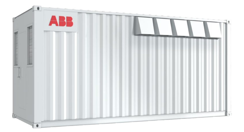
ABB inverter station PVS800-IS – 1.645 to 4.156 MW

The ABB inverter station is a compact turnkey solution designed for large-scale solar power generation. The inverter station houses all equipment that is needed to rapidly connect ABB central inverters to a medium voltage (MV) transformer station.