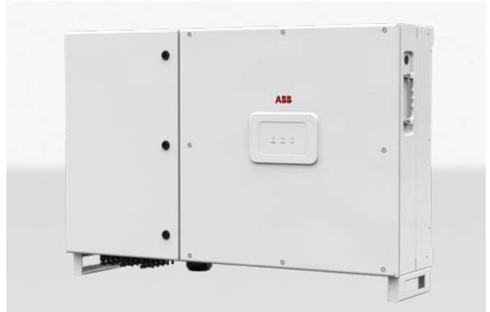
ABB string inverters PVS-60-TL-US