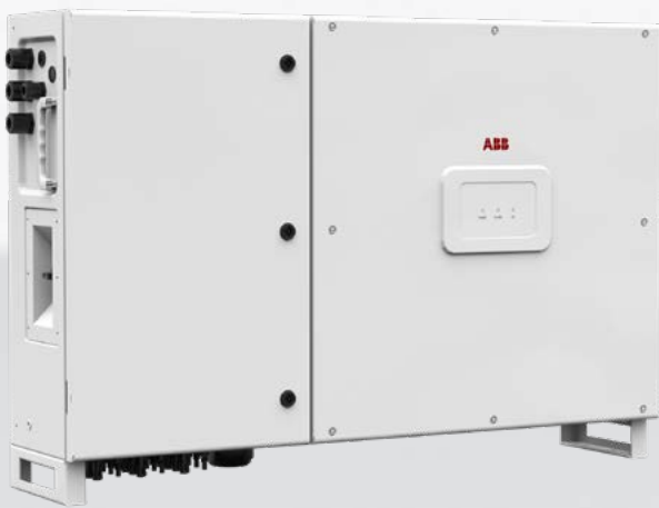
— PVS-60-TL string inverter

This new addition to the PVS string inverter family, with 3 independent MPPT and power ratings of up to 60 kW, has been designed with the objective to maximize the ROI in large systems with all the advantages of a decentralized configuration for both rooftop and ground-mounted installations.