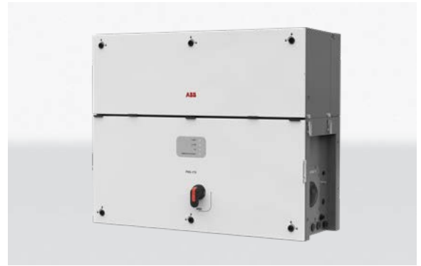
ABB string inverters PVS-166/175-TL-US 166.5 to 185 kW