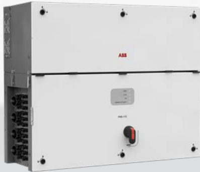
— PVS-166/175-TL-US three-phase string inverter