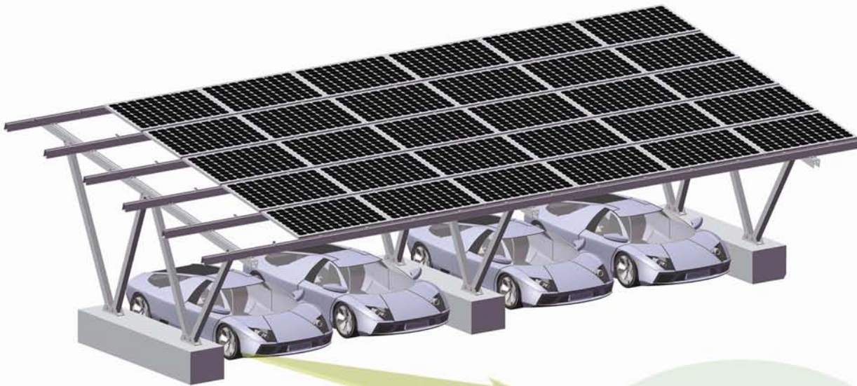
A1 : Single Row Carport