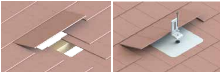
Flashing on Roof