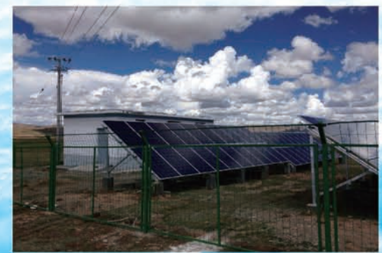
Specialty battery for plateaus brings light to thousands of families in Qinghai. The CCTV News given report on the "Golden Sun Project"