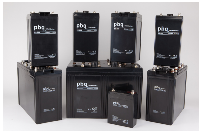
The SC family.