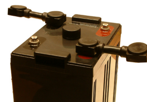
Interconnectors are supplied with all cells.