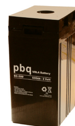
pbq SC-500, 2Volt - 500Ah with cover installed.