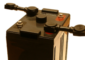
Interconnectors are supplied with all cells.