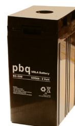
pbq SC-500, 2Volt - 500Ah with cover installed.