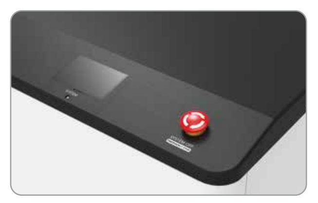
Top-Side Control Panel

The ION MATE series are All-in-One Energy Storage Systems that integrate high-quality, long-life Lithium Iron-Phosphate Batteries, Battery Management Systems (BMS), AC Chargers, Photovoltaic (PV) Chargers, DC- AC inverters and System Control, with wireless monitoring, into a self-contained, self-managed unit to effectively utilize solar energies and AC grid power while providing back-up capability.