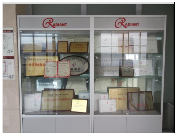
Certificate Photo -- Honor 4