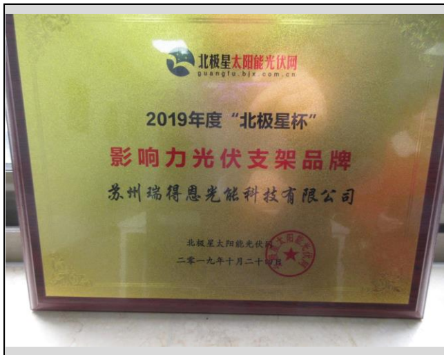
Certificate Photo -- Honor 1