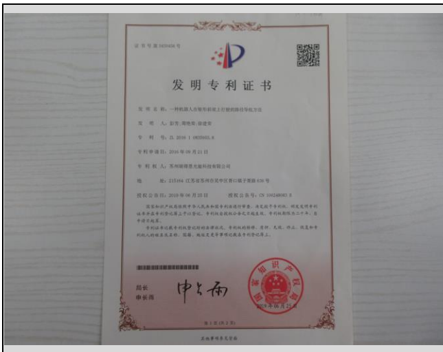
Certificate Photo -- Patent 3