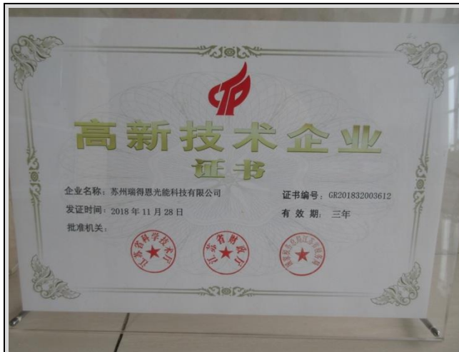
Certificate Photo-- High New Technology Enterprise Certificate