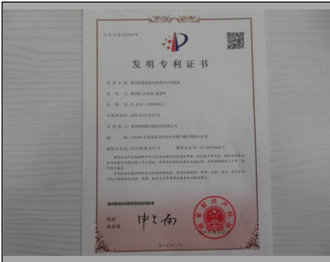
Certificate Photo -- Patent 1