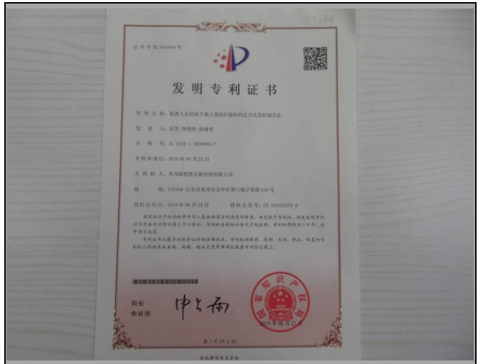
Certificate Photo -- Patent 2