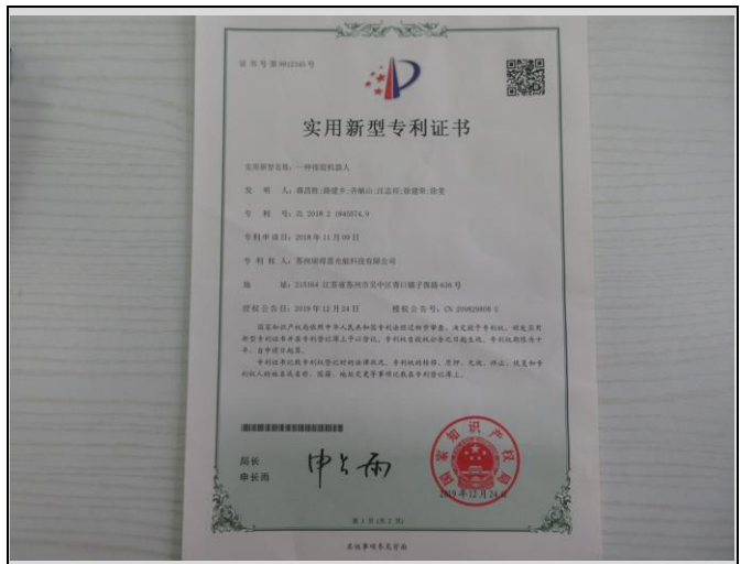
Certificate Photo -- Patent 4