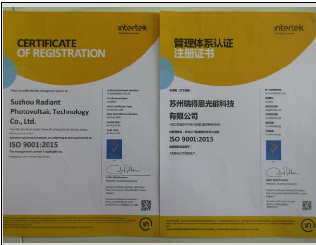
Certificate Photo -- ISO9001:2015