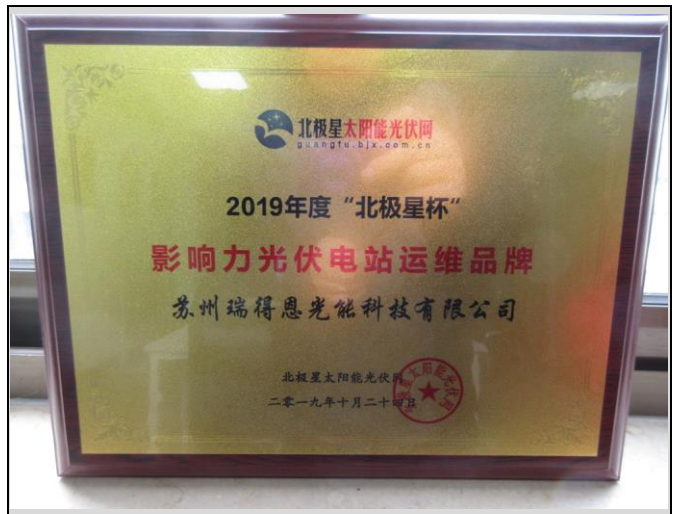
Certificate Photo -- Honor 2