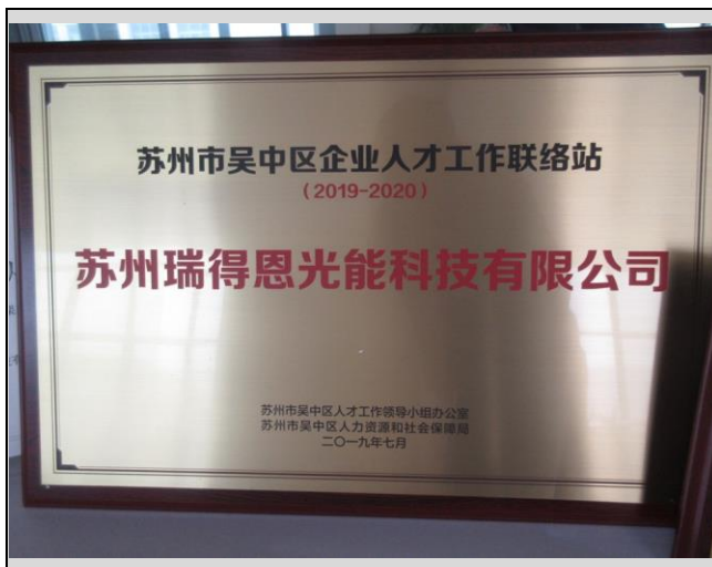
Certificate Photo -- Honor 3