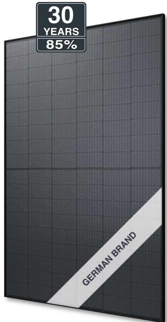
Fig. similar 108MGEN231005A