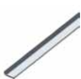
Horizontal Water Rail