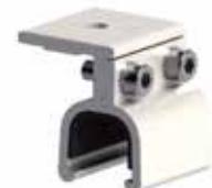
700 Kliplok (Small)