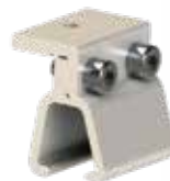
406 Kliplok (Small)