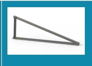
2. TRIANGULAR MOUNTING SYSTEM