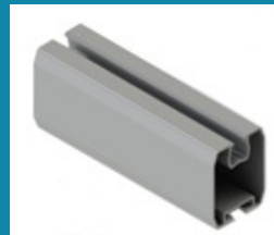
3. PV RAIL