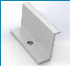
1. END CLAMP