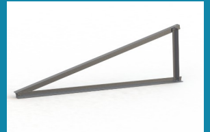
4. TRIANGULAR MOUNTING SYSTEM