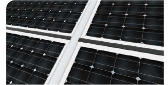
Aluminum Alloy Cover Plate, Can Dust-proof