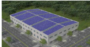
Strong Wind Resistance