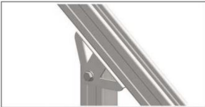
Front / rear leg and beam