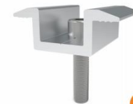
Middle Clamp Kit 30/35/40mm AL6005-T5&SUS304 Black optional