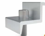
End Clamp Kit 30/35/40mm AL6005-T5&SUS304 Black optional