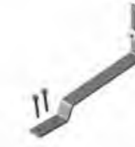
Slate Tile Roof Hook 1# KS-HK-F01