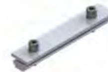
CR 1# Rail Splice Kit KS-CR1-SP

Application: Pitched roof with tiles Fastening: Roof hooks onto rafters Roof Pitch: Up to 60° Module Type: Framed and frameless modules Module orientation: Landscape/portrait Layers of Rails: Single/double layer, cross rail installation Advantages: Low fitting costs Every size of module array possible For all common rafter distances