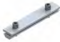
CR 1# Rail Splice Kit KS-CR1-SP

Application: Pitched roof with tiles Fastening: Roof hooks onto rafters Roof Pitch: Up to 60° Module Type: Framed and frameless modules Module orientation: Landscape/portrait Layers of Rails: Single/double layer, cross rail installation Advantages: Low fitting costs Every size of module array possible For all common rafter distances