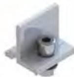
CR 1#Rail Clamp with flange nut KS-CRC-01