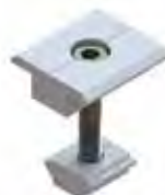
End Clamp KS-EC2-F40