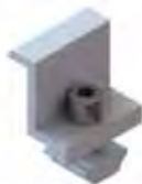
Middle Clamp KS-IC2-F40