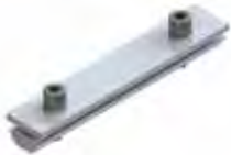
End Clamp KS-EC2-F40