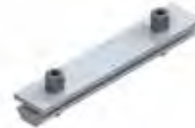
CR 1# Rail Splice Kit KS-CR1-SP