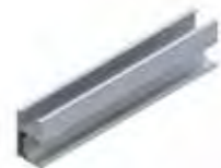
CR 3# Rail KS-CR3-Length