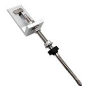
L-Foot Hanger Bolt