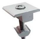
Mid Clamp Kit