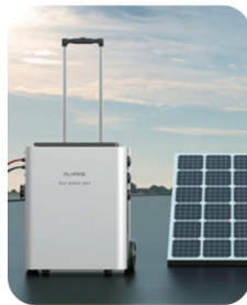
Charging With Solar Panels