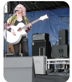
Electricity For Mobile Business Activities