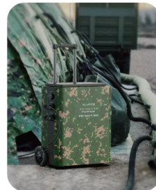
Emergency Power Supply In Disaster Areas