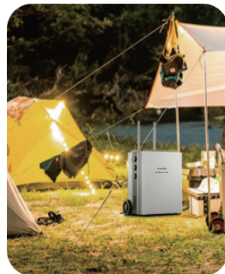
Electricity For Outdoor Activities