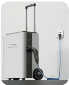
Charging With Electricity