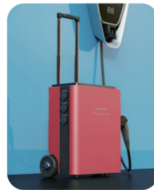
Charging With Charging Pile