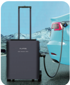
Emergency Power Supply For Car Charging