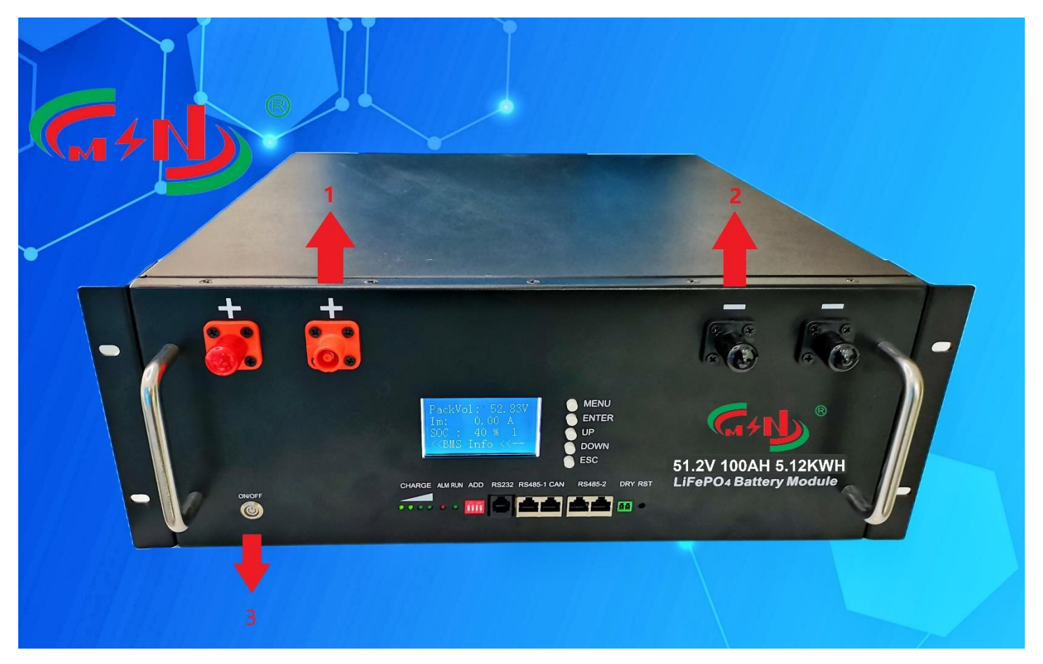
(1. Output +