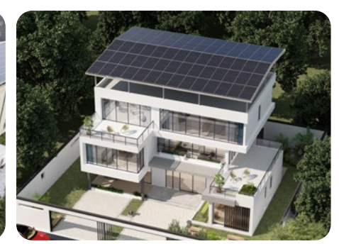
Solar-plus-storage and EV Charging Carport Flat-to-pitched Roof Conversion