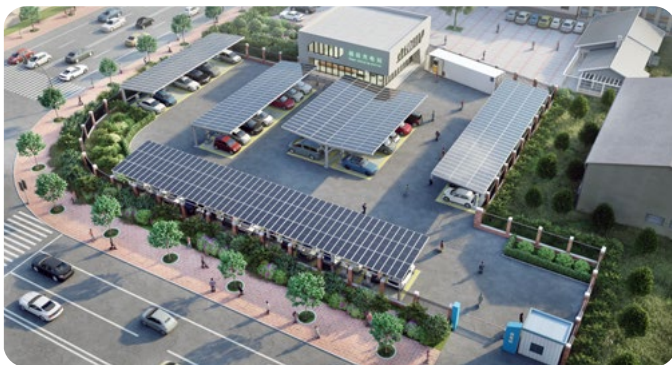
PV Charging Carport With Storage