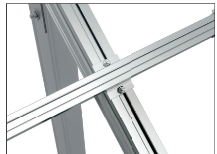
Fixing of the module support on the rafter