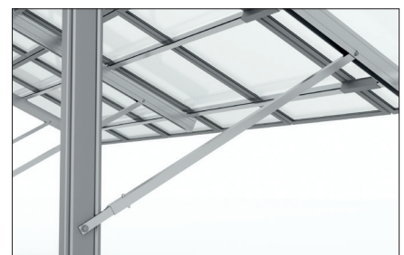
Linking of the diagonal to the C-post