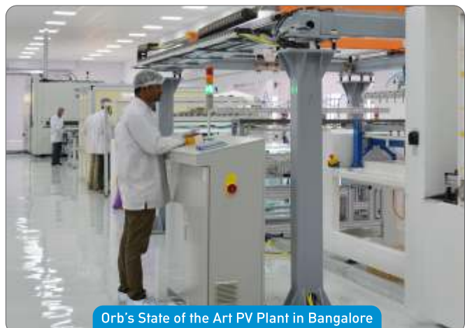
Orb's State of the Art PV Plant in Bangalore

Call us: + 91 9900520505 Email: sales@orbenergy.com Web: www.orbenergy.com Orb Energy, 95 Digital Park Road, 2nd Stage, Yeshawanthapura, Bengaluru 560022, India