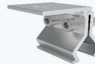
7 Kliplik 02