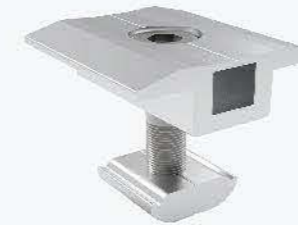
4 Middle Clamp Kit