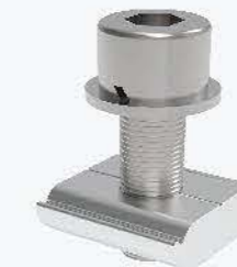
5 Rail Fastener