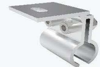
9 Kliplik 04