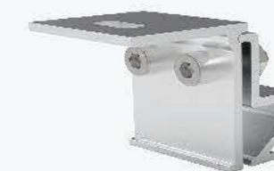
11 Middle Clamp Kit