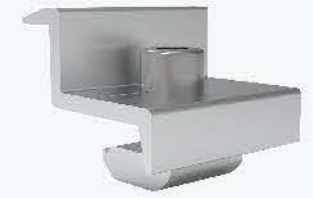
3 End Clamp Kit