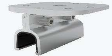
6 Kliplik 01