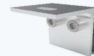
8 Kliplik 03