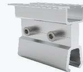
10 Kliplik 05