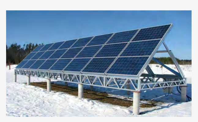
EverExceed PV modules offer BTS-leading performance for a variety of applications

Uses advanced surface texturing to improve efficiency