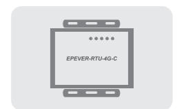
EPEVER-RTU-4G Wireless Data Transmission Unit