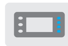
MT-75 Remote Meter