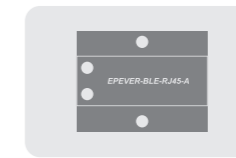
EPEVER-BLE-RJ45-A Bluetooth Module