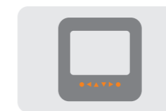
MT-50 Remote Meter